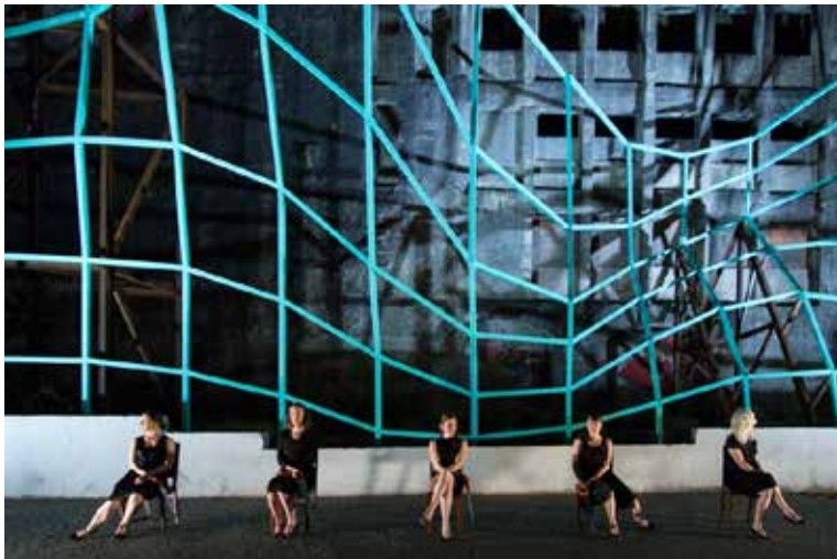
lights placed either in front of audience on floor floods or behind audience on stands

We have used Par-cans & Fresnels on floor stands that cross - and fresnels with barn doors either in a grid or placed on stands behind an audience. We have also used portable battery operated floods for more remote locations.